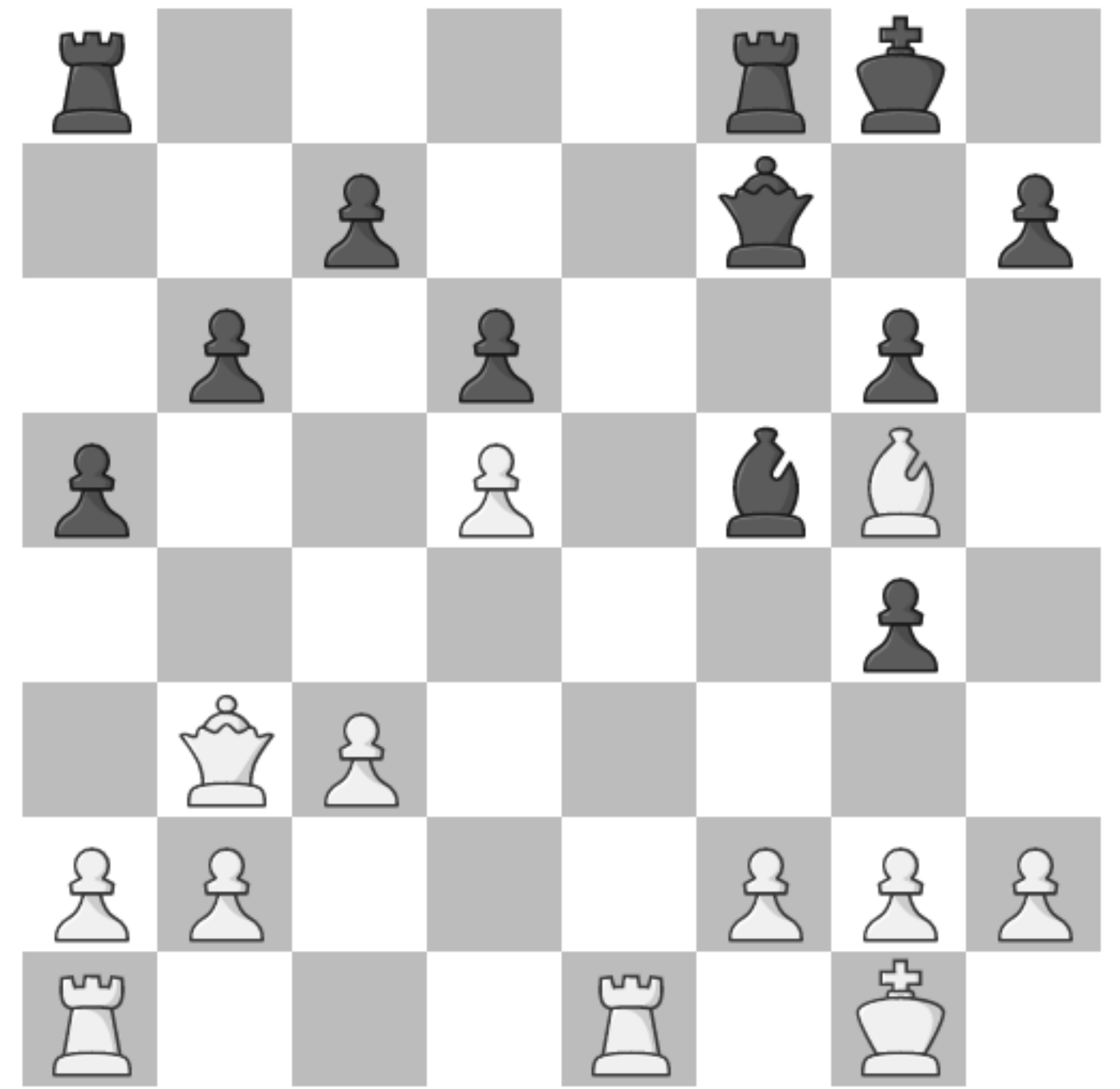
White to play and find the trap