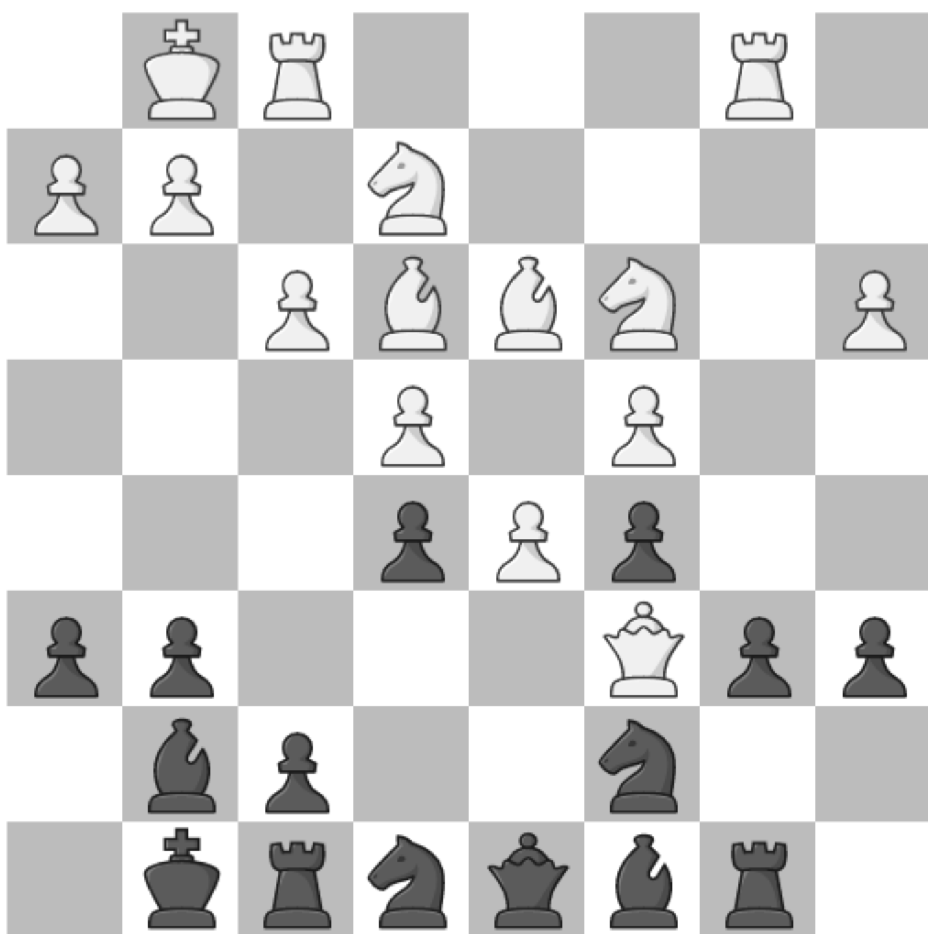
Black to play and find the trap