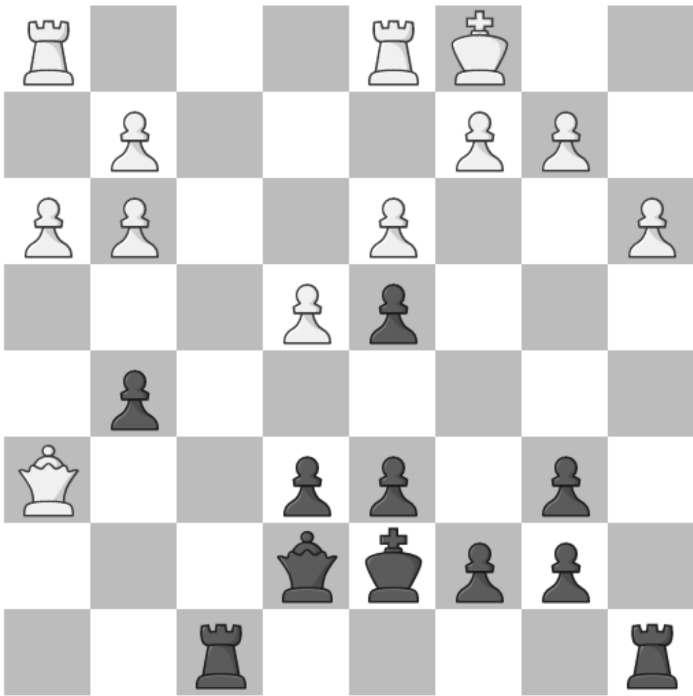
Black to play and find the trap (2 moves)