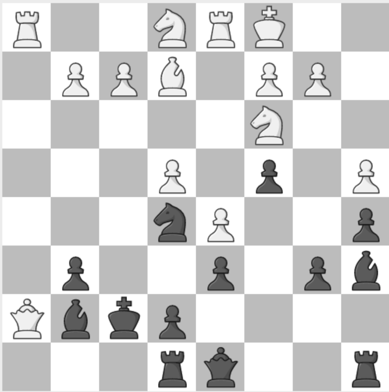
Black to play and find the trap